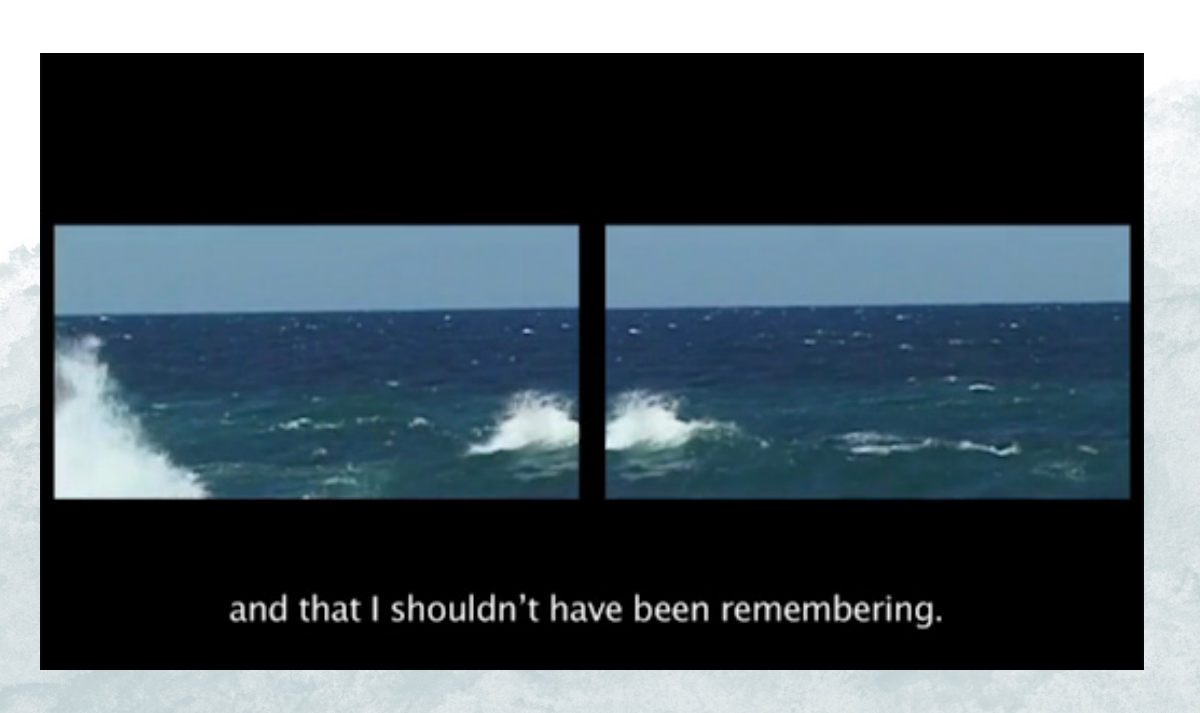
"I keep in my head scenes, images, sounds that have no great interest and that I shouldn't have been remembering." "My Pain is Real," 2010.

a privatized, proprietary and subjective pain, it is selfaware of the notorious unknowability and immeasurability of sensation and of pain in particular. <sup>10</sup> The title's insistence paradoxically seems to "really" mean the film's indexical qualities (the documentary photographs), while the animated hand seems to summarily represent an abstract and unaccountable agent. Hollywood has trained viewers to watch violence on every platform indiscriminately as fiction and makeup. Cherri's particular lesions are both documentary evidence just as much as they are "special effects." Not only the meaning but also the sound of the title points away towards an association, a kind of Freudian slip. Cherri has also noted that other people revealed a double-entendre in the title to him that he had not initially noticed: "is real" sounds like "Israel," perhaps the "real" (if reality is the subconscious) referent of the pointing and source of the pain. "Israel" in this sense functions as a symbolic placeholder that structures experience (always with at least the potential to host) in an otherwise disrupted relation to home. What might otherwise read as gestures of touching "the real" function instead as deixis, pointing to a displaced agent.